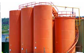
Reservoirs: silos, oil tanks, water tanks, etc.