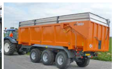
Equipment: cranes, trailers, containers, machines, etc.