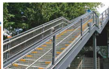
Metallic objects: balustrades, fences, railings, shelves, doors, etc.