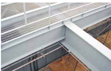
Steel structures: bridges, flyovers, pipelines, towers, pipe racks, beams, etc.

lower costs for surface preparation • shorter downtime and less labor costs thanks to faster and easier application • proven durability